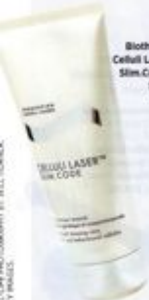
Biotherm Cellul Laser Slim.Code, $95.

Nivea Body Contouring Cream Q10Plus (top), $9.75; Weleda Birch Cellulite Oil , 100ml, $32.50; Beautician's Secret Body Sculpt , $19.95.